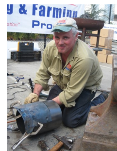
Photo: Senator John Madigan demonstrating some of his hands-on practical blacksmithing skills making a replica Ned Kelly helmet at the Industry day at Reliance Manufacturing.

The AM&F Program held an Industry Day at Reliance Manufacturing in Dandenong, Victoria this month to increase the awareness of state and federal politicians as well as the general public on industries manufacturing locally made products. Hon Bob Katter MP and Senator John Madigan addressed the gathering on the need to support Australian made products.