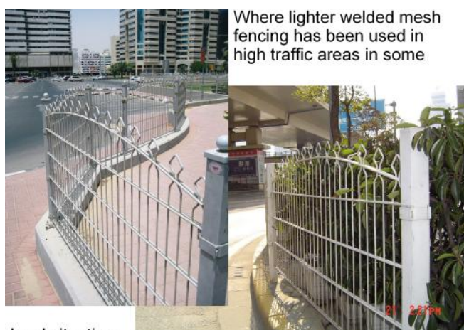
Where lighter welded mesh fencing has been used in high traffic areas in some

The 2015mm wide robust panels are manufactured using twin 8mm horizontal wires with 6mm vertical wires. The mesh aperture size is 200 x 65mm. This fencing system couples decorative design with robust construction and makes it the pedestrian fencing of choice for many overseas councils and state authorities.