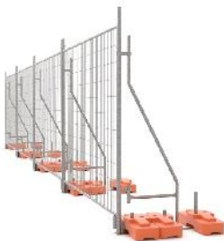
Photo shows Titan's Eco® Zero-Trip Base which can be used in conjunction with any existing temporary fence system.

By adding Titan Eco® Zero-Trip Bases to any existing temporary fencing system Managing Director, Greg Bloom , says the benefits you will achieve are zero tripping, increased wind and impact loadings and the ability to make the fence Anti-Tamper evident.